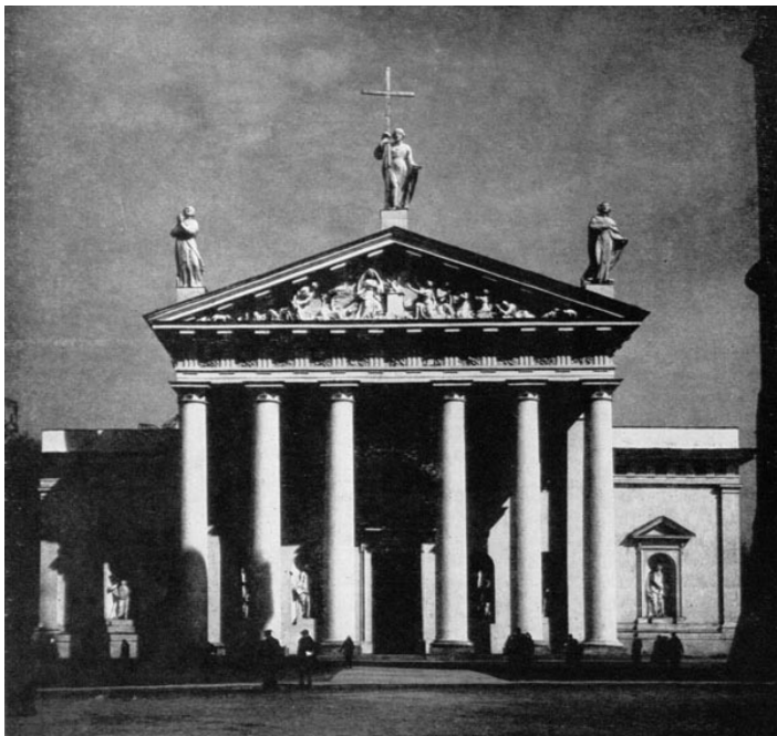
Cathedral of Vilnius, erected in 1778 by architect Stoka-Gucevicius.