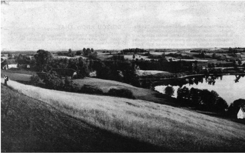
Lake shore in Eastern Lithuania.