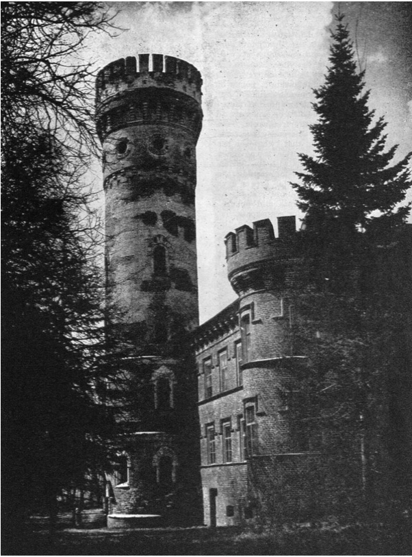
The Castle of Raudonė on the banks of Nemunas River, built in the 14th century.