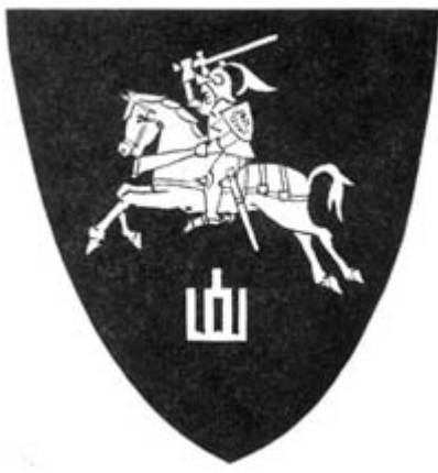
LITHUANIAN NATIONAL EMBLEM