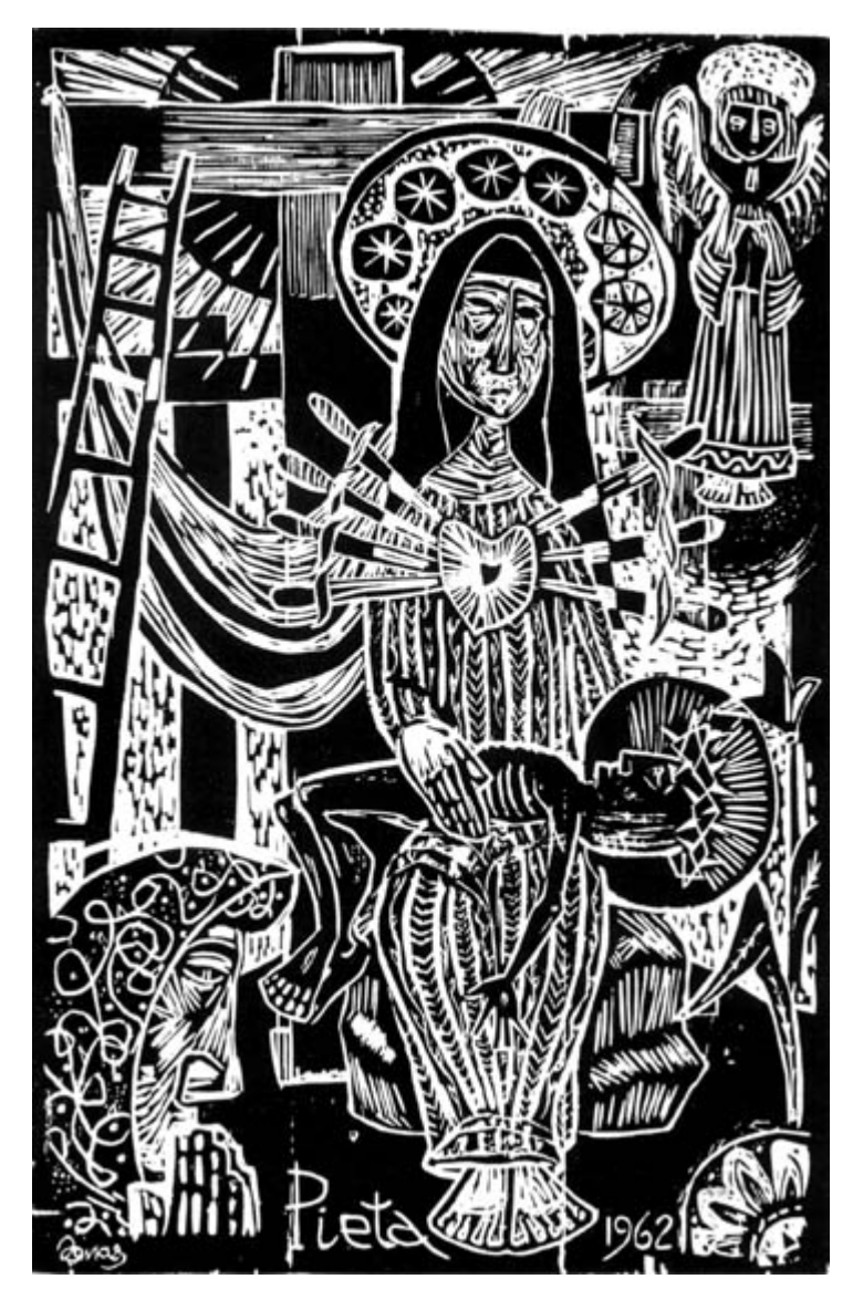
PIETA • Wood-cut, 1962