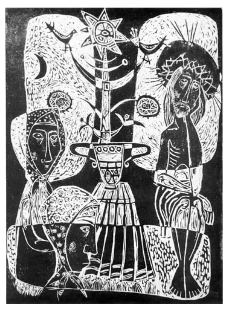
THE OLD SAMOGITIAN CHAPEL • Lino-cut, 1962