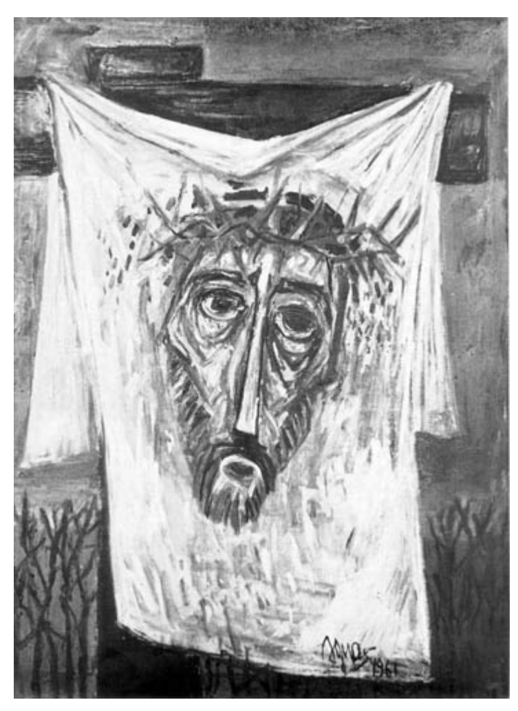
VERONIKA'S VEIL Oil • 1962