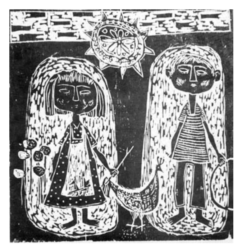
THE YOUNG SHEPHERDS • Wood-cut, 1962