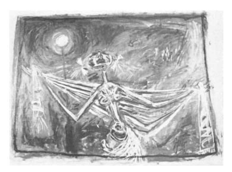
THE GIRL IN THE DARK • Oil 1961