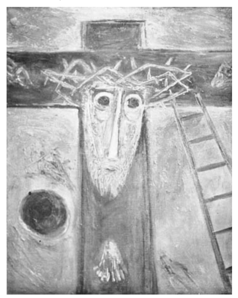
THE CROSS • Oil, 1959