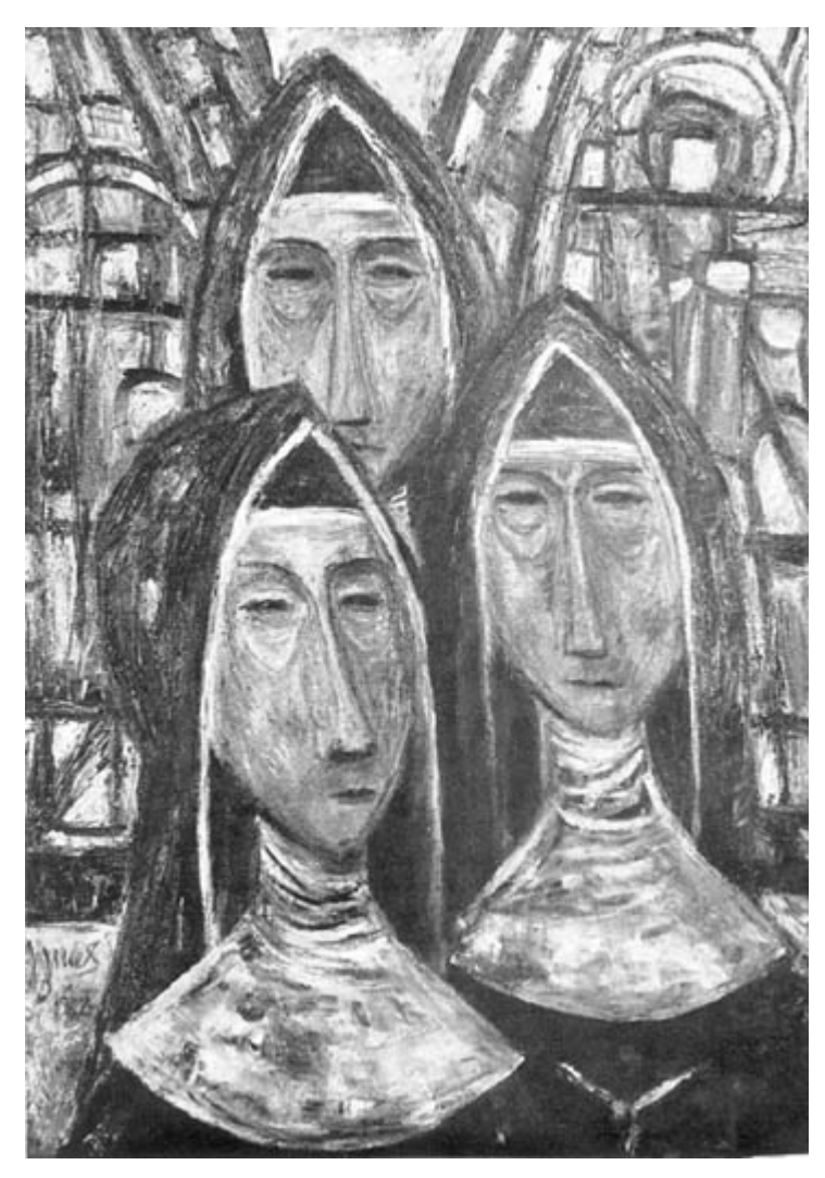
NUNS IN THE CHAPEL • Oil, 1962