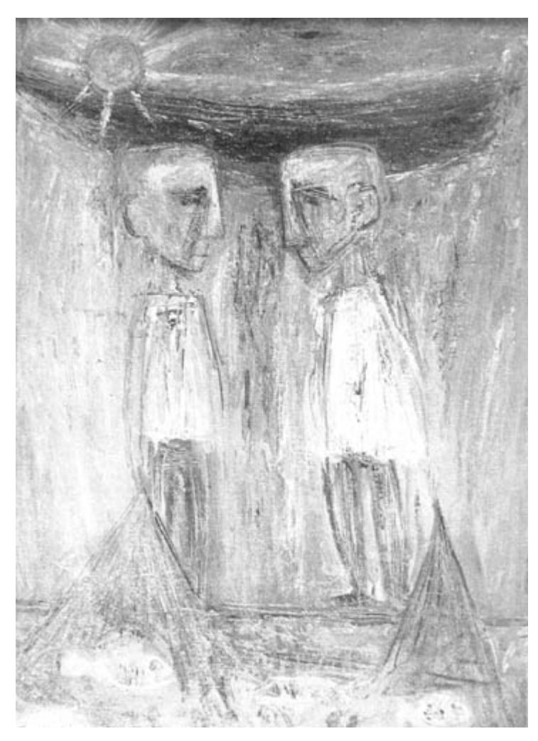
FISHERMEN Oil • 1962