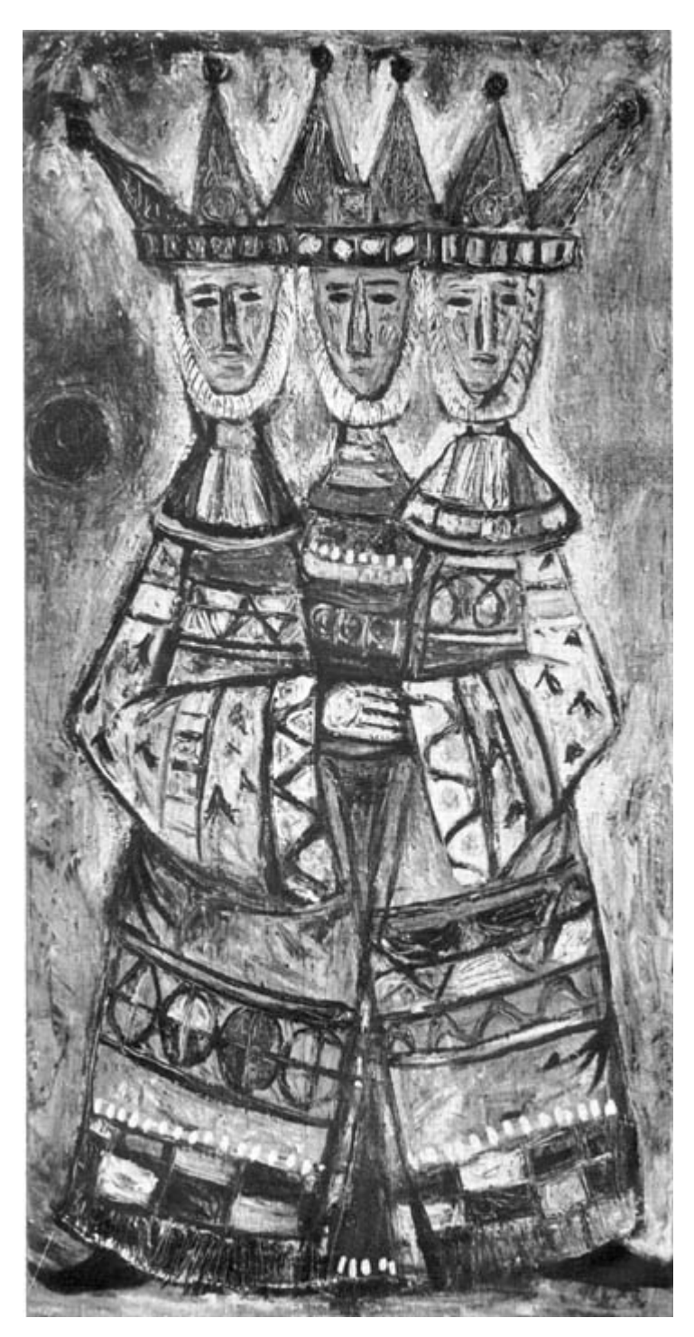
THREE KINGS • Oil, 1959