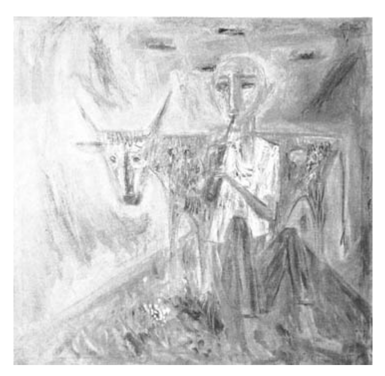
SHEPHERD • Oil, 1959