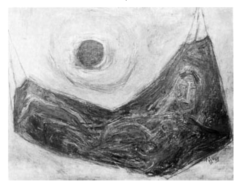
WOMAN IN THE HAMMOCK • Oil, 1962